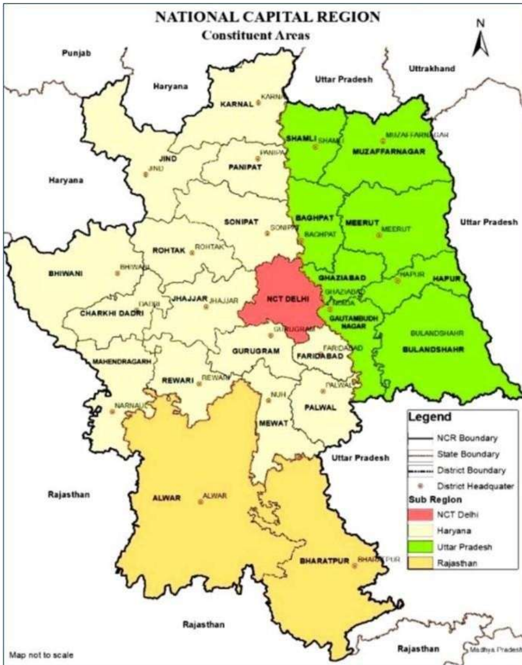
Figure 1: Constituent Areas of NCR